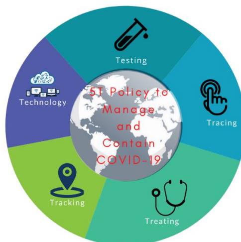
Fig. 2: 5T Policy to Manage and Contain COVID-19