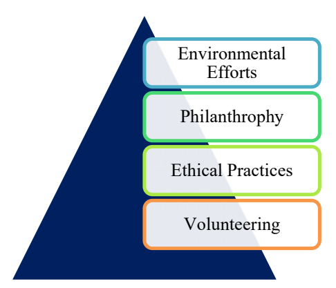
Fig. 1 : Classification of CSR