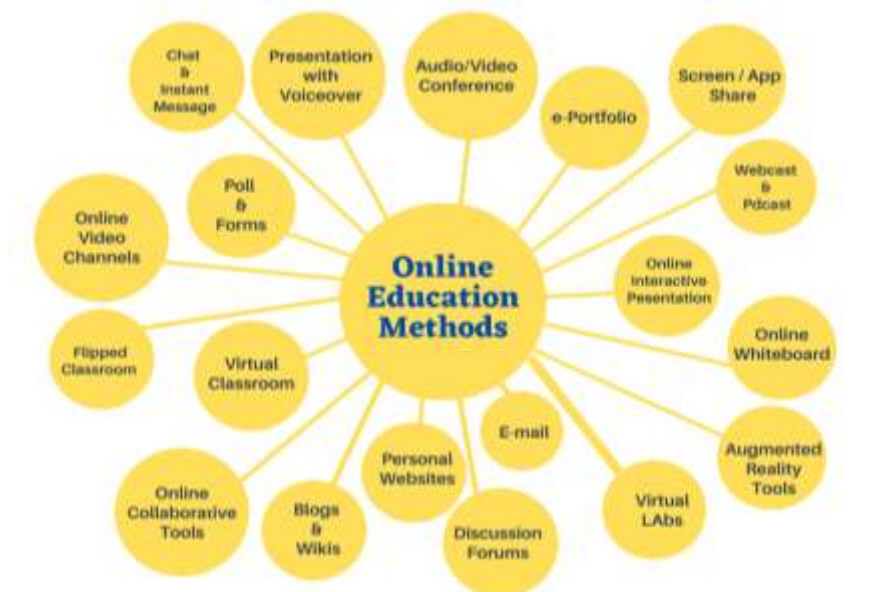
Fig. 1: Available online education methods.

Online education is realized by using a range of synchronous and asynchronous ICCT tools. Some tools such as wiki, blogs, email, chats, etc. are web tools, also called 'social media. Some others such as Google Meet, Zoom, Microsoft Team, Cisco WebEx, Zoom, etc. support face-to-face interactions between the teacher and the students. And a few tools such as Google Classroom, Moodle, etc. create Virtual classrooms mimicking the real classroom. Asynchronous tools are tailor-made for tasks that expect manifestation and more time to fulfill. They are especially used when learners hesitate to collaborate effectively in real-time interactions due to shy nature, lack of language fluency, or socio-religious factors. However, synchronous tools provide an interactive platform for a higher degree of social presence. Here instructors and participants speak, chat, and discuss the subject matter freely without any hesitation in real-time scenarios. Figure-1 given below provides a glimpse of different options available for online education [27].