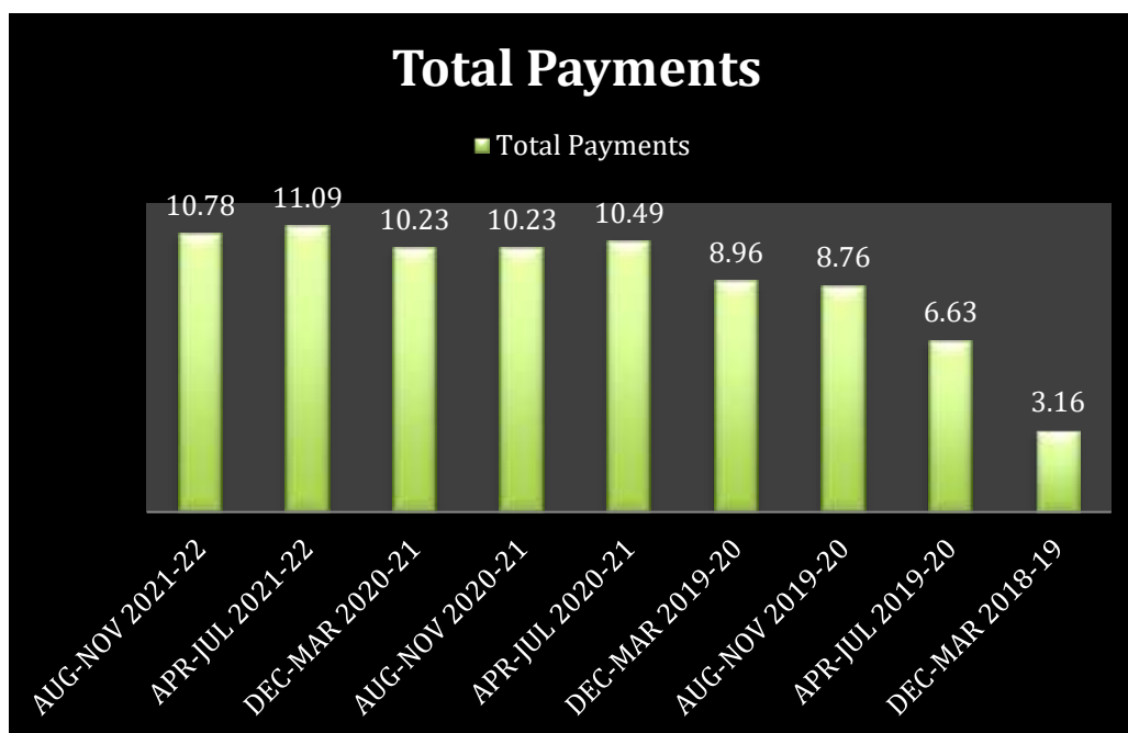
Fig. 2: Graph showing payments under PM-Kissan scheme