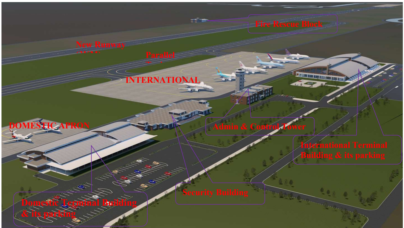
Fig 2: Project 3-D Master Plan